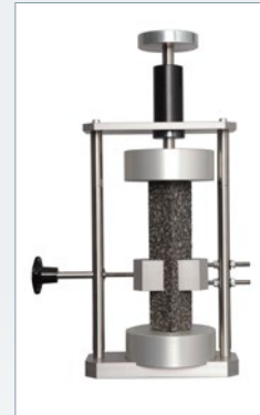
TSRST Restrained Gluing Jig