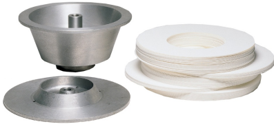
75-B0022/2, 75-B0022/1 Spare bowl/cover and filter discs