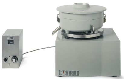
75-B2222, 75-B2322 Explosion proof models