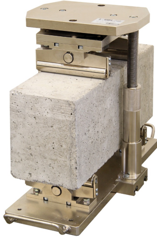
50-C9010/C Flexural device for beams