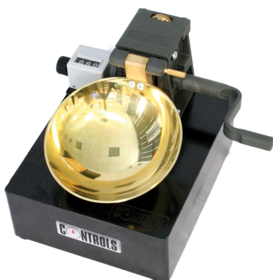
Liquid limit device, 22-T0030/AE