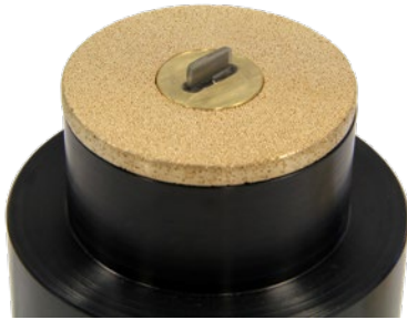
Bender element with sintered bronze stone

The complete STANDARD configuration suitable for Triaxial System includes: