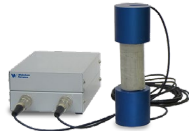
Stand-alone configuration complete with master signal conditioning control unit

STAND-ALONE CONFIGURATION with a suitable mounting system, for performing the test without confined pressure or vertical load.