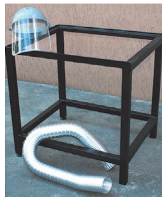
Metal stand 75-PV0008/5, safety visor 75-PV0008/10 and exhaust ducting (supplied with the machine)