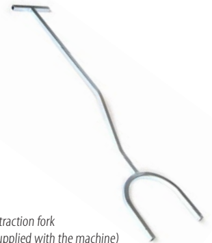
Extraction fork (supplied with the machine)