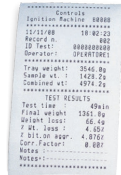
Example of printed report