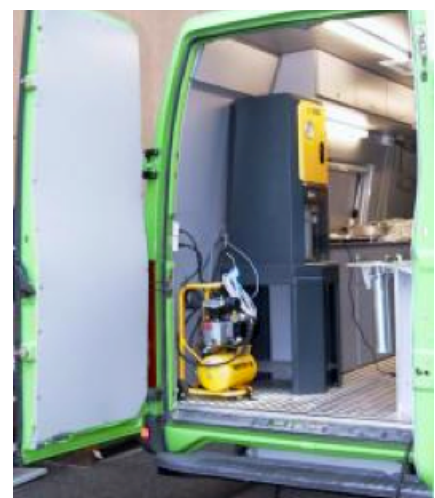
Gyrocomp installed inside a van as a road mobile laboratory