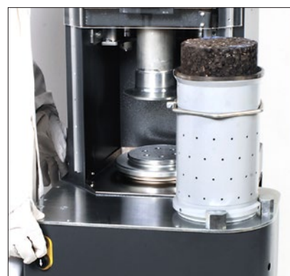
Integrated worktop with electromechanical extruder option 78-PV2520/15

ILS Internal angle measurement apparatus (For detailed information see page 45 of the IPC Global's catalogue.)