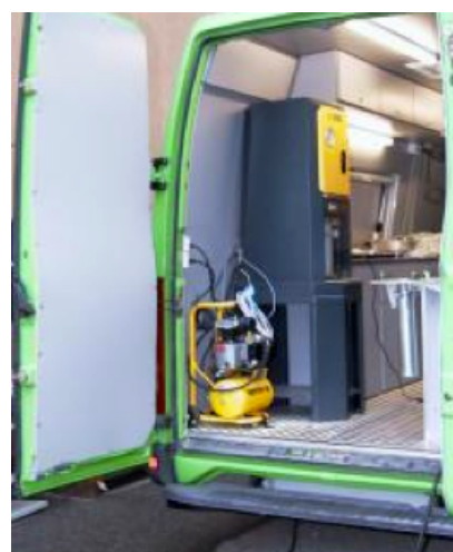
Gyrocomp installed inside a van as a road mobile laboratory