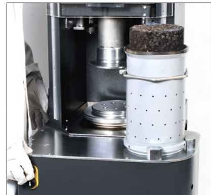
Integrated worktop with electromechanical extruder option 78-PV2520/15

ILS Internal angle measurement apparatus (For detailed information see page 45 of the IPC Global's catalogue.)