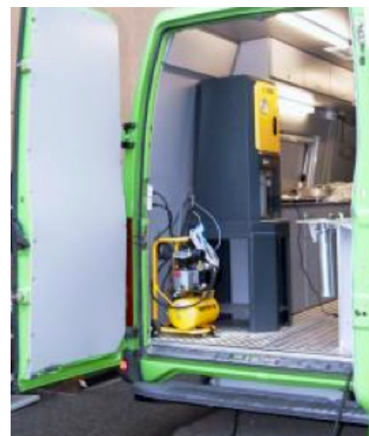
Gyrocomp installed inside a van as a road mobile laboratory