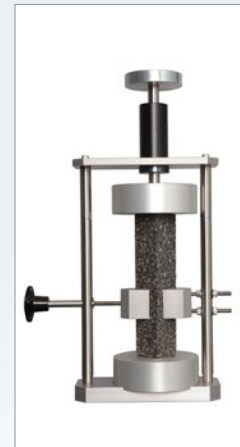
TSRST Restrained Gluing Jig