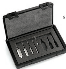
81-B0118/4 Spindle kit