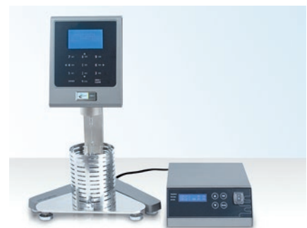
Temperature control unit 81-PV0118/T

Rotational Viscometer, high performance version, calibration certificate, USB, WIFI, Bluetooth, temperature sensor, datalogger software and power supply cable. Viscosity range 100-40 000 000cP, rotational speed 0.01-200rpm. 100-240V/50-60 Hz/1ph.