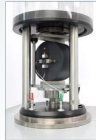
Indirect Tensile Kit