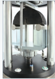
ASTM D8044 (LSU SCB)

IPC Global offers a wide variety of accessories to extend the range of their advanced testing machines. The range includes fixtures for performing a variety of tests to local and international standards, displacement transducers and specimen preparation equipment. IPC Global's accessories are constructed of high quality robust materials thus ensuring superior performance and appearance for years to come.