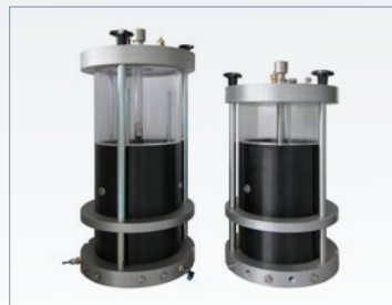
Large and Standard Size Universal Triaxial Cell Side by Side