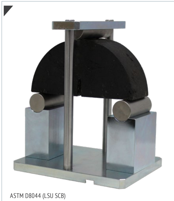
ASTM D8044 (LSU SCB)

IPC Global's Semi-Circular Bend (SCB) Kits have been designed and engineered to further increase the capabilities of your Universal Testing Machine, AsphaltQube or Asphalt Standards Tester.