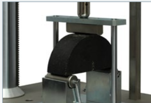
AASHTO TP124 Method B (Illinois FIT)