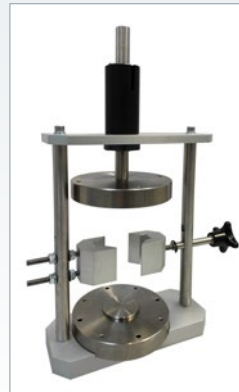
TSRST Restrainted Gluing Jig

IPC Global's accessories are constructed of high quality robust materials thus ensuring superior performance and appearance for years to come.