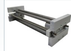
79-PV70652 – UTSST Unrestrained Glue Jig