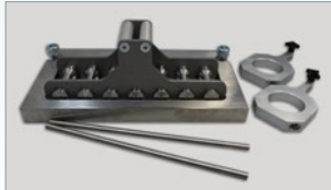
79-PV70650 UTSST TSRST Upgrade Kit

IPC Global's superior UTS software is known for its simplicity in use, clarity of results and analytical power. UTS Software allows for real time graphing of results and configurable real time transducer levels screen, as well as customisable test templates to streamline the testing process.