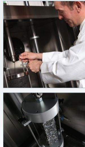
TSRST Thermal Stress Restrained Specimen Test