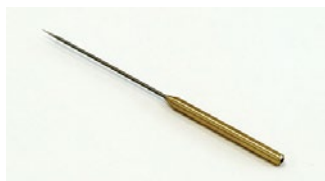
81-B0113, penetrometer needle

Verified penetrometer needle 2.5 \pm 0.5 g. fully hardened, tempered and polished stainless steel. Conforming to ASTM D5 and EN 1426. Supplied complete with official UKAS Verification Certificate.