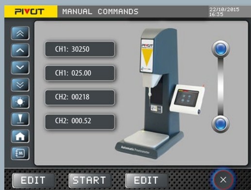
Alternative manual adjustment of the needle position