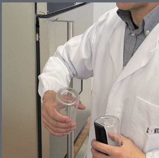
Door locking system allowing easy opening also with busy hands